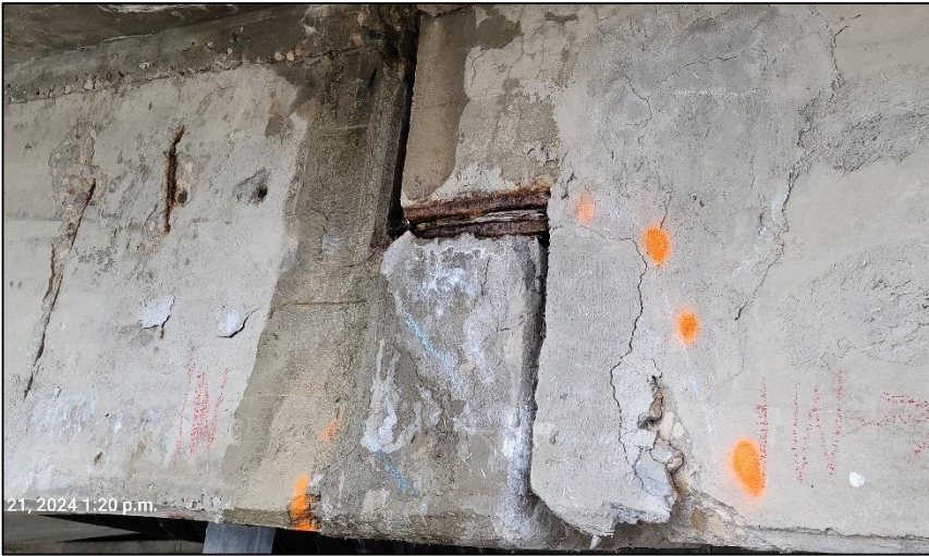
HALF - JOINT