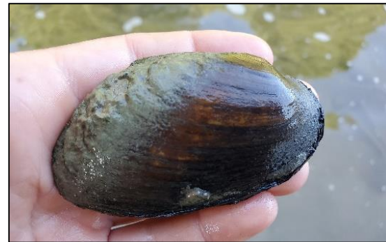
FRESHWATER MUSSEL HABITAT