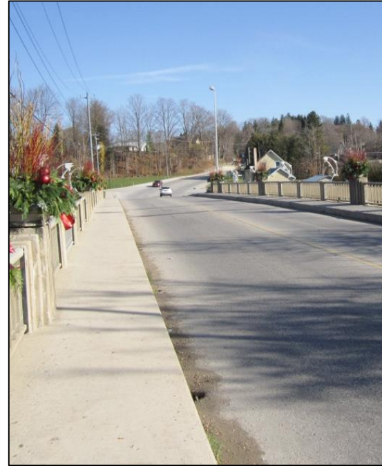
BRUCE ROAD 4